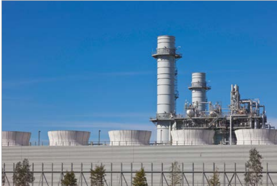
Mechanical evaporative systems are often more efficient than dry systems, reducing water usage at power plants.