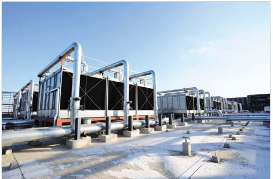
Evaporative cooling towers are an integral part of many data center cooling systems, depending on their location.

Recently some have questioned the use of cooling towers, citing water scarcity to bolster their arguments. But a thorough examination of water use for local onsite cooling towers compared to water use to generate power at regional fossil fuel power plants reveals surprising results.