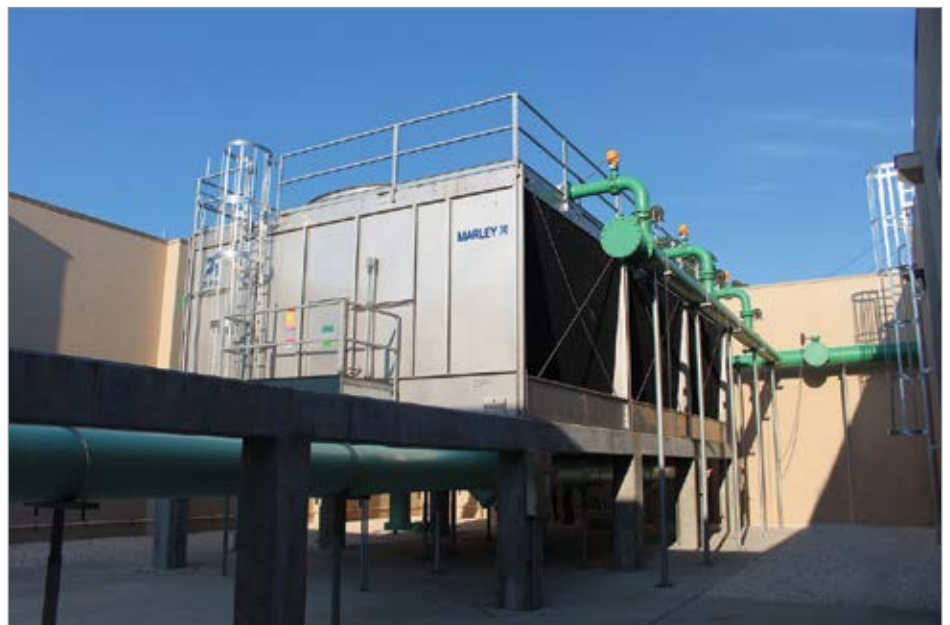
Some systems can utilize "free cooling" or "water-side economizer" technology for higher efficiency.

The study looked at cooling for a sample data center with a steady 1,500 kW cooling load. The authors compared a standard efficiency water-cooled chiller system and a standard efficiency air-cooled chiller system, as well as an evaporative system with no mechanical cooling. The water-cooled plant includes a chiller system, pumps, cooling tower and plate/frame heat exchanger in series with the chiller.